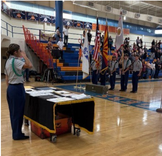
Chollo High School April 30, 2025

Chollo / Cienega / Desert View / Flowing Wells